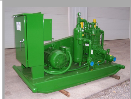
Basic Single Phase Electric Unit

From basic reciprocating units to complex rotary-screw compressors, from standard green to finish coating in any color, we do that!