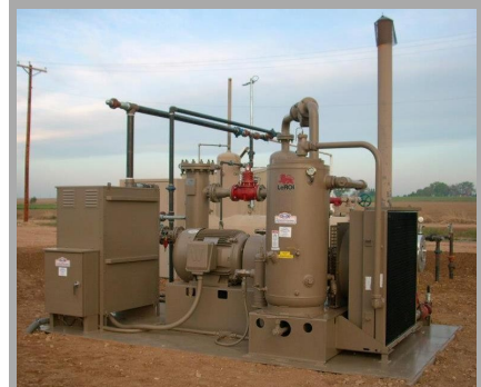
100 HP Rotary Screw Compressor